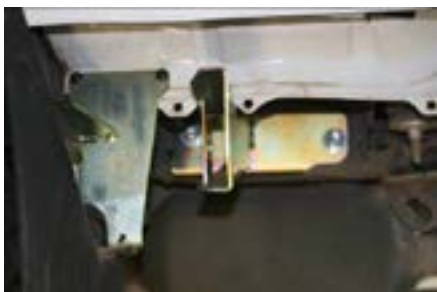
Left hand side Pictured